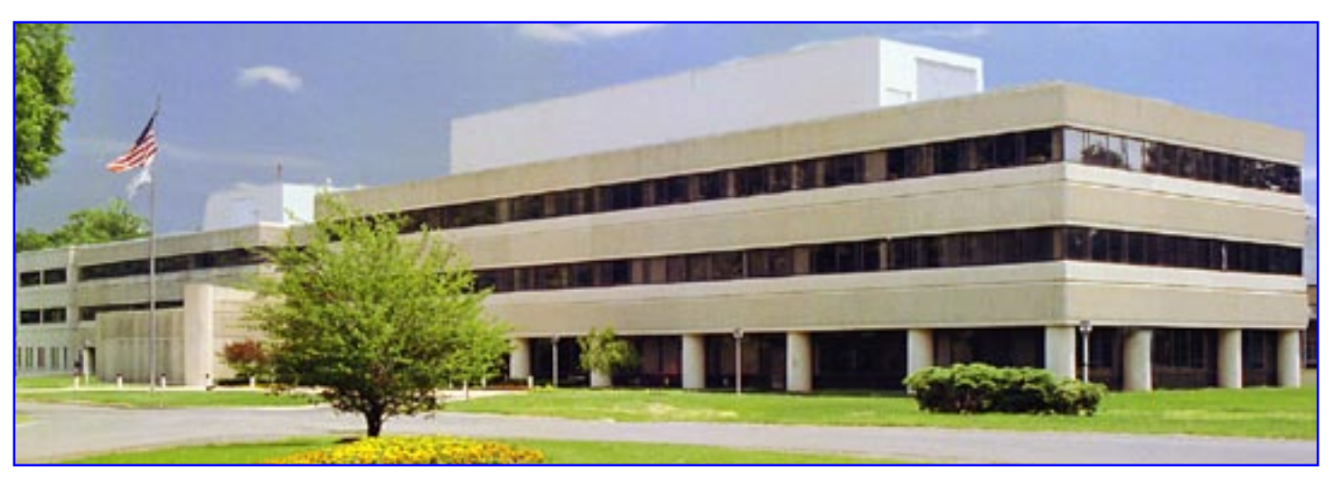
Prepared for the U.S. Department of Energy under Contract DE-AC02-09CH11466.